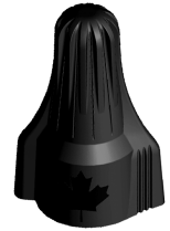
Can-Twist XT 150°C/ 302°F