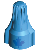
Can-Twist 105°C/ 221°F