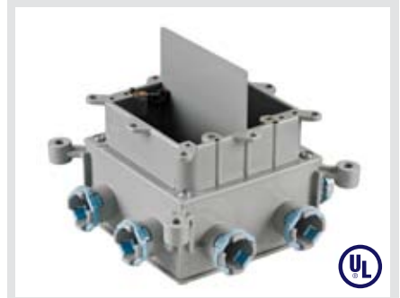
ENT SQUARE SLAB BOX