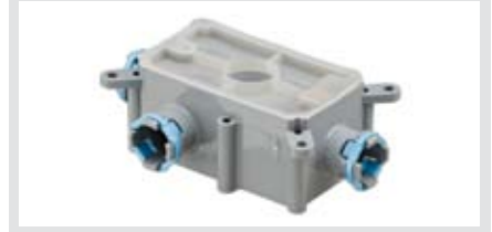
ENT SHALLOW SINGLE GANG CONCRETE WALL BOX