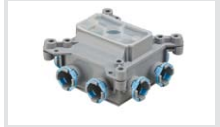
ENT DEEP SINGLE GANG CONCRETE WALL BOX