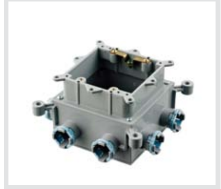
ENT ISOLATOR MODULE SLAB BOX