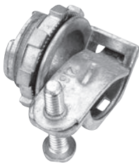
Zinc Die Cast Locknut