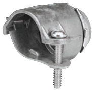
Zinc Die Cast Locknut