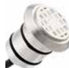
16149SS, CBR Honeycomb