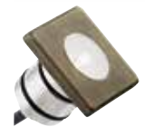
16147CBR, SS Square Trim