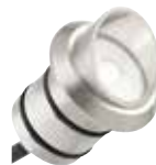
16142SS, CBR Cowl

Use the Kichler 12V Integrated LED All-Purpose Recessed Light practically anywhere to create a dynamic lighting effect. Versatile and functional, this landscape light can be embedded in concrete to mark a path, installed over a patio to deliver ambient light, or in the ground to uplight trees or walls for beauty and safety. Add on one of our accessory tops for more application possibilities and to create various lighting effects.