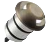
16144CBR, SS 2-Way Opening