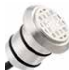
16149SS, CBR Honeycomb