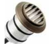
16146CBR, SS Louver