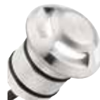
16145SS, CBR 4-Way Opening