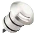
16148SS, CBR Single Opening