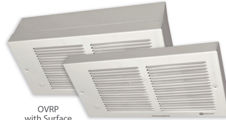
OVRP with Surface Mounting Box