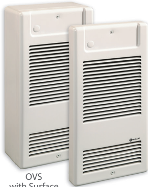
OVS with Surface Mounting Box