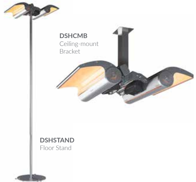
DSHCMB Ceiling-mount Bracket