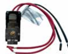
Double Pole Thermostat Kit