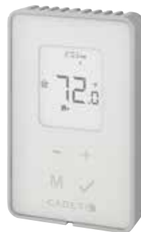
TEP302DW Cadet Programmable Double Pole Electronic Thermostat

Watts Volts 1250 / 2163 / 2500 120 / 208 / 240