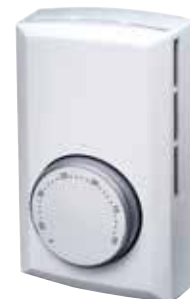
TS321W Dimplex Single Pole Thermostat

Watts Volts 1500 / 2600 / 3000 120 / 208 / 240