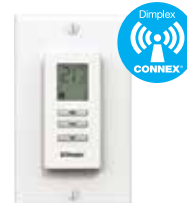
DPCRWS CONNEX® Single-zone Controller