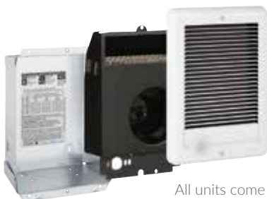
Product Dimensions (WxHxD) 9" x 12" x 4" 22.9 cm x 30.5 cm x 10.2 cm

*Units do not have a built-in thermostat