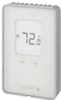
TEN252DW Cadet Non-Programmable Double Pole Electronic Thermostat

Watts Volts 1250 / 2163 / 2500 120 / 208 / 240