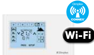
CX-WIFI CONNEX® Multi-zone Wi-Fi Programmable Controller