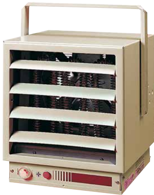
Product Dimensions (WxHxD) 13" x 19-1/2" x 13-3/8" 33 cm x 49.5 cm x 34 cm