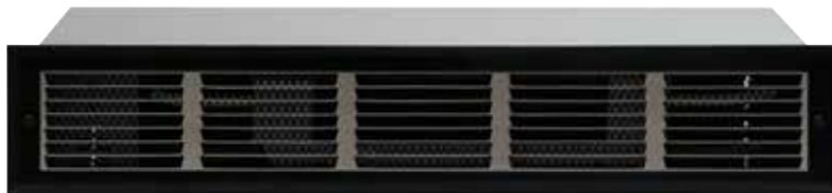
Shown with black trim kit