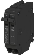
01 THQLT Tandem breaker