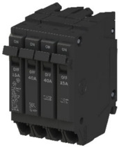
02 THQLQ Quads breaker