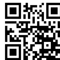
Brilliance Smart app