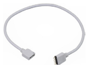
2 - 1' Flex connectors