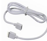
2 - 3' Flex connectors