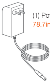
(1) Power supply unit 78.7in