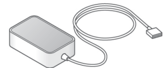
(1) Control unit 15.7in