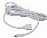
2 - 5' Flex connectors