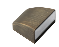
16143CBR Side Fire Sconce