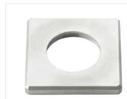
16147SS Square Trim