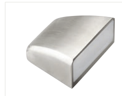
16143SS Side Fire Sconce