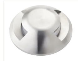
16144SS 2-Way Opening