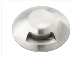
16148SS Single Opening