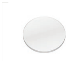
16180FRO Frosted Lens SS