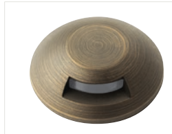
16148CBR Single Opening