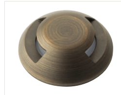
16144CBR 2-Way Opening