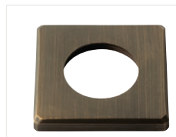
16147CBR Square Trim