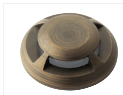
16145CBR 4-Way Opening