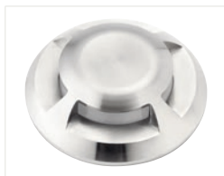
16145SS 4-Way Opening