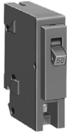
CHOM 1-Pole 1 space required.