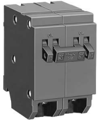
CHOMT Quad Circuit Breaker 2 spaces required.