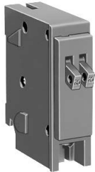
CHOMT 1-Pole Tandem 1 space required.