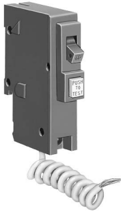
CHOM 1-Pole GFI 1 space required.