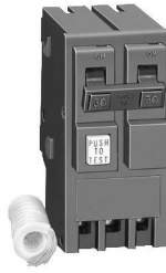
CHOM 2-Pole GFI 2 space required.