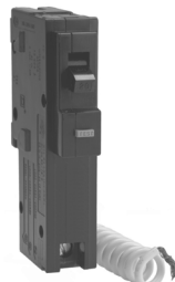
CHOM-AFI 1 space required.