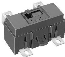
QOM2 Frame Size