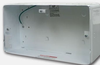
Surface Wall Enclosure