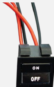
Double Pole Disconnect